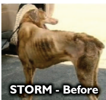
STORM - Before

July 4, 2012, it was the smell that alerted the neighbors, a smell that grew over the course of a year, becoming so bad that people couldn’t leave their homes. They worried that the woman who lived in the house with the odor had died. A 911 call dispatched The Humane Society and NY State Police, and what they found led to the end of a terrible, heartbreaking secret. The woman, presenting herself as an animal rescuer and rehabber, had a house full of animals - most of them dead. There were 16 dogs, all Dobermans, 13 of them still alive. The dogs had been locked in crates, living ankle deep in their own feces; they had ammonia-burned skin under matted coats. All were emaciated with open wounds; some weighed less than 40lbs.